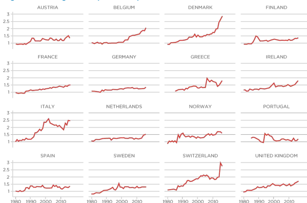
Figure 2: Average markups in European countries, 1980-2016